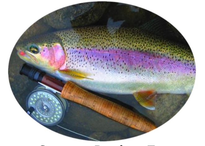
Gorgeous Rainbow Trout