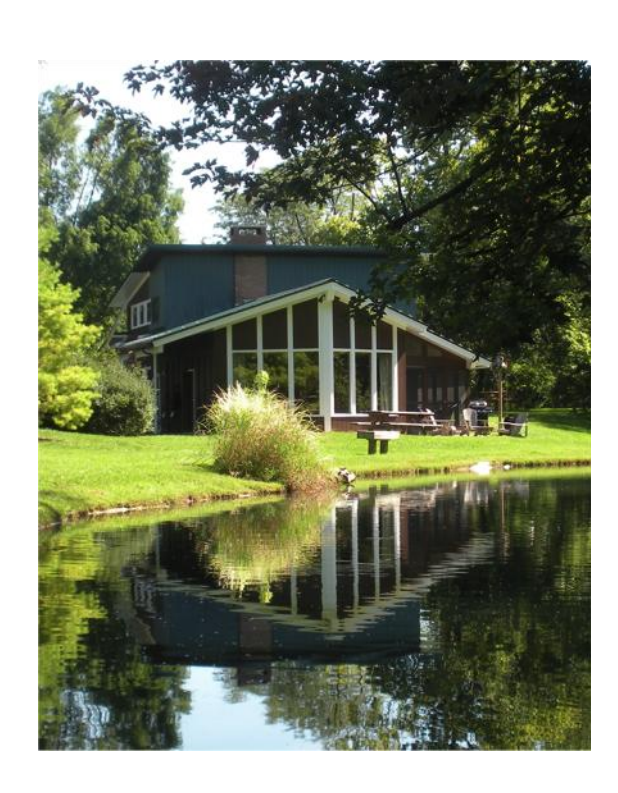
The Jack Klages Club House

Or, leave a message at the club office at: 937-599-5784